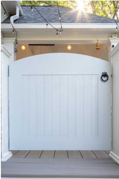
Painted Custom Gate