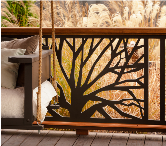
Painted branches panel installed with stained wooden handrails.