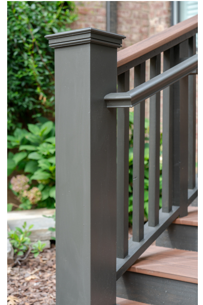
Painted Hermitage Sleeve & Cap